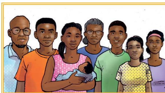
In 15 years' time