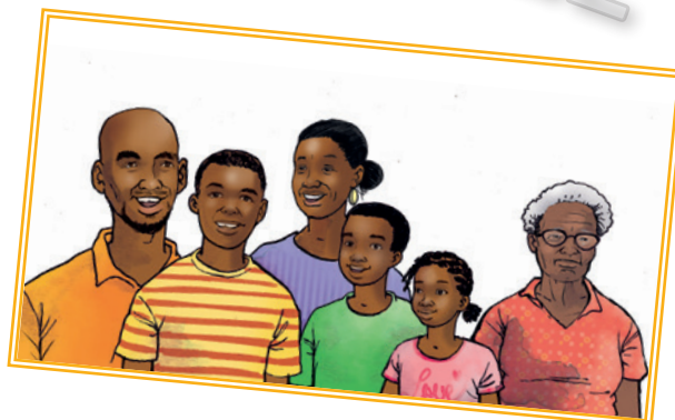
In 5 years' time