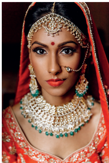
▲ Figure 16.2 An Indian bride dressed in traditional red Hindu wedding clothing