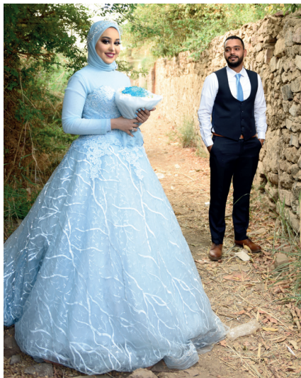
▲ Figure 16.6 A Muslim bride in Egypt wearing a wedding dress and hijab