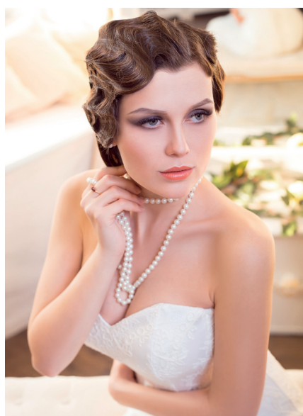
▲ Figure 16.10 A 1920s-themed wedding look

Not all weddings are traditional, so you should always try to have a selection of accessories to cater for different themes.