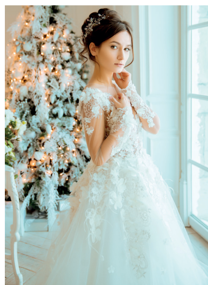
▲ Figure 16.11 A Christmas-themed wedding look