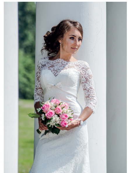
▲ Figure 16.5 A Western-style white wedding dress