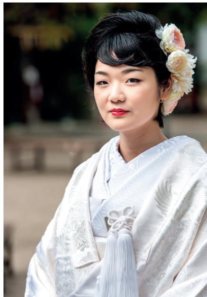
▲ Figure 16.4 A Japanese bride in a traditional white wedding kimono