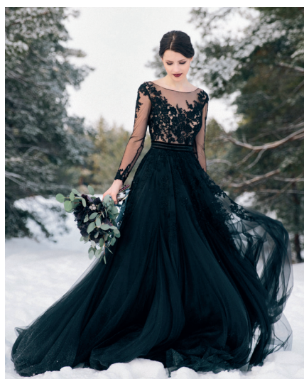
▲ Figure 16.9 A gothic-themed wedding look

A winter wedding might incorporate a Christmas theme or a winter wonderland theme, with Christmas trees, fairy lights and fake snow. The hair and make-up for this type of wedding could be tailored to the specific winter theme. The lips are normally a reddish colour, and the hair could be dressed with a tiara or ribbon.