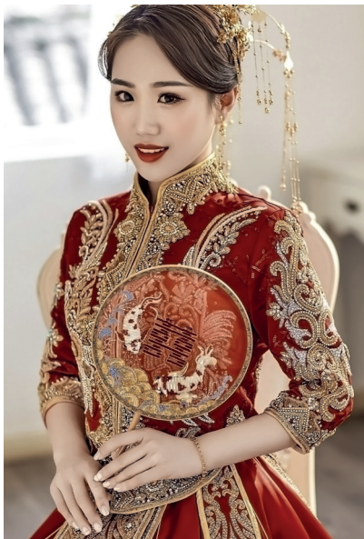
▲ Figure 16.3 A bride wearing a traditional Chinese red wedding dress

Kimono: a traditional Japanese garment. It is T-shaped and has square sleeves, and is usually tied with a belt ( obi ).