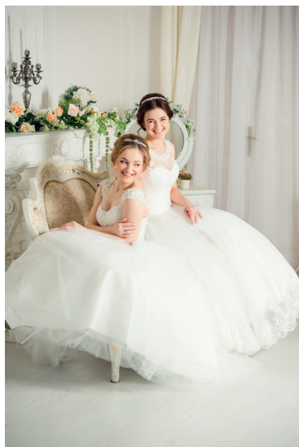
▲ Figure 16.8 A fairy tale-themed wedding look