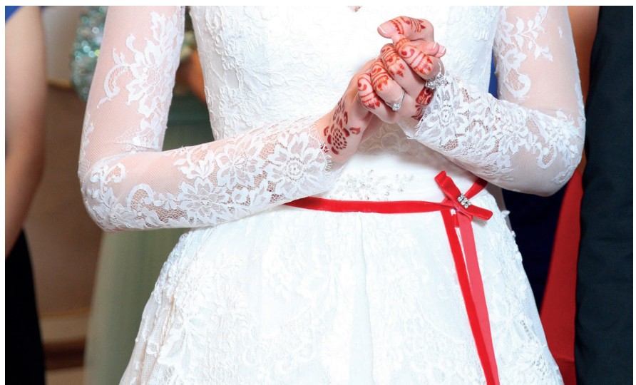
▲ Figure 16.7 White wedding dresses are popular at Turkish wedding ceremonies

A traditional Turkish wedding is a lavish occasion with many guests. For the bride, the preparation may begin five days prior to the wedding, when the house is filled with roses and the bride traditionally puts on a veil that will hide her face until the wedding day (although many modern-day brides choose not to do this). In the following days, the bride may visit a Turkish bathhouse to get her skin soft and bright for the special day. She may also have a 'henna night' with close female friends and relatives where henna is put in the palm of the bride's hand along with a gold coin, which is thought to bring prosperity.