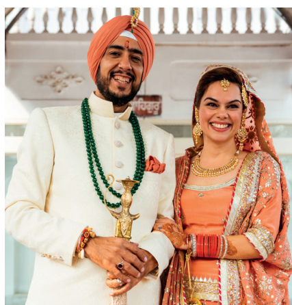
▲ Figure 16.1 A Sikh wedding

Henna should be tested on the skin at least 24 hours prior to application.